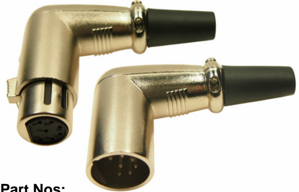
Part Nos: FC60957N - 7 Pin Female XLR plug FC60967N - 7 Pin Male XLR plug