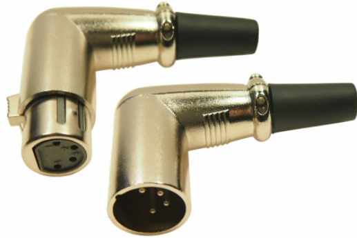
Part Nos: FC60954N - 4 Pin Female XLR plug FC60964N - 4 Pin Male XLR plug