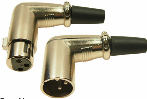
Part Nos: FC60953N - 3 Pin Female XLR plug FC60963N - 3 Pin Male XLR plug