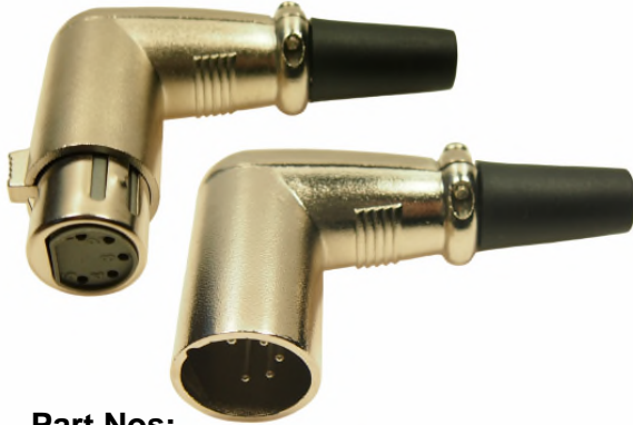
Part Nos: FC60955N - 5 Pin Female XLR plug FC60965N - 5 Pin Male XLR plug