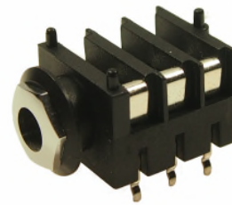
S4SC/BBB/PC-C 4.6mm NOSE

The CLIFF ® S4S is a stacking version of the classic S4 model. It offers the increased packing density of the stacked Jack with the classic domed nut appearance.