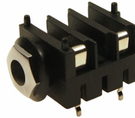
S4SA/BNB/PCC 2.9mm NOSE