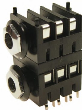
S4SB/BBB/PC-C 3.5mm NOSE